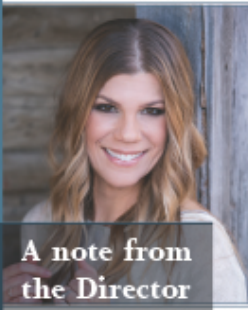
A note from the Director